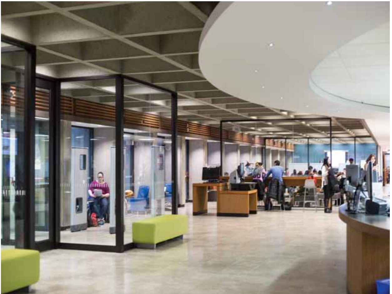
NEW Main Entrance - Interior