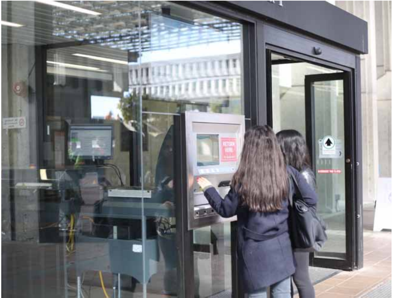
NEW Book Drop