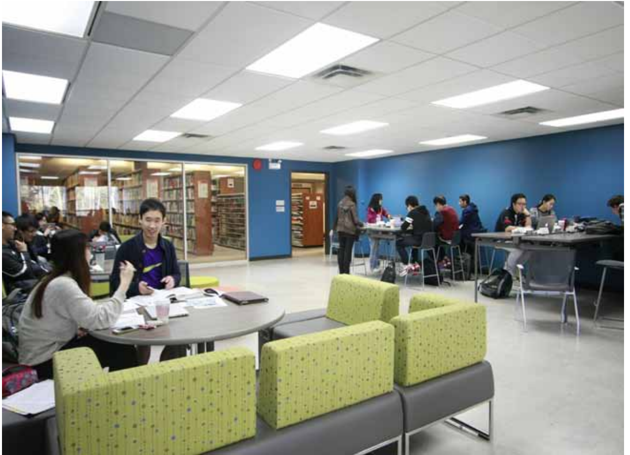
NEW Study Area