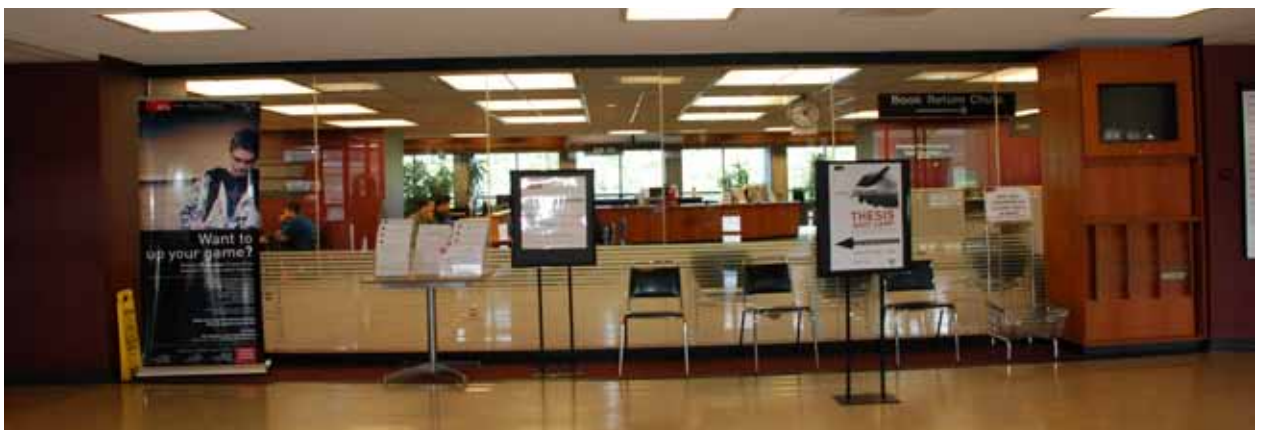
Before: View Upon Entry