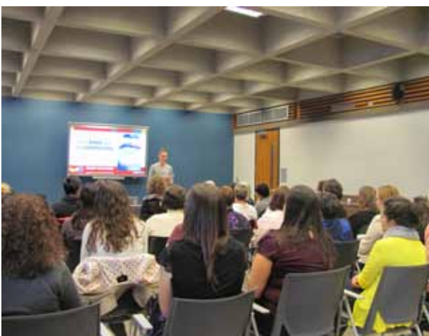
NEW Learning and Events Room

The use of a circular Service and Reserves area in the centre of the floor facilitated flow and complemented the very rectilinear architecture. Self-serve and service points were re-located to facilitate unmediated discovery and reduce confusion, for example the Service desk, book return, and self-checks. Glass walls contribute passive climate control at the entrance. Areas are dual or triple-purpose: the consulting/study area and the programming/class/study room.