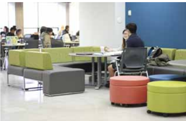
NEW Study Area