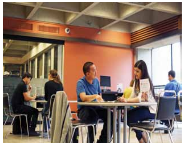
EXPANDED Learning Commons Consultation