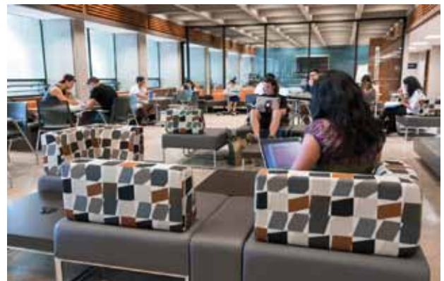
NEW Student Lounge