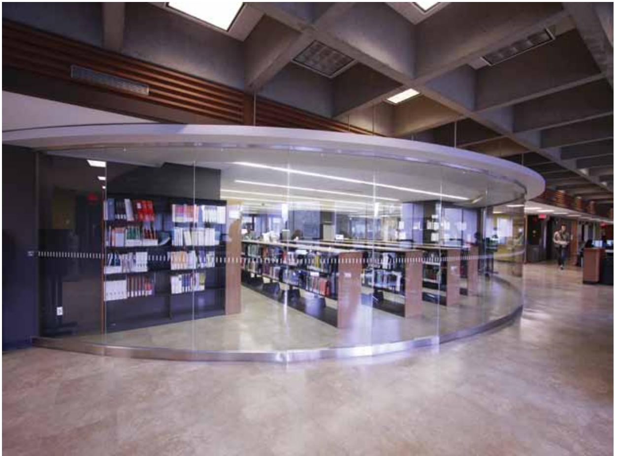
NEW Reserves Stacks