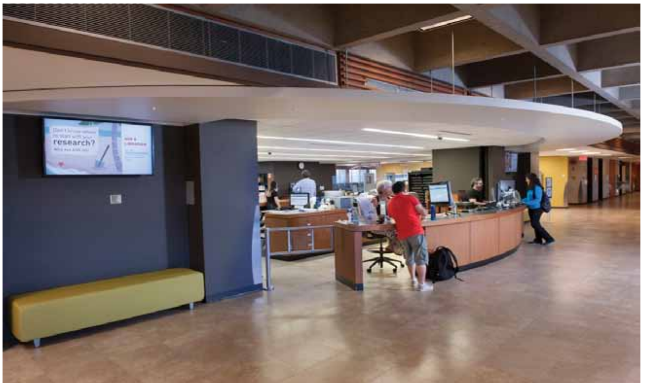
NEW :View Upon Entry

University Facilities championed the proposed project as meritorious, and once it was approved managed the project.