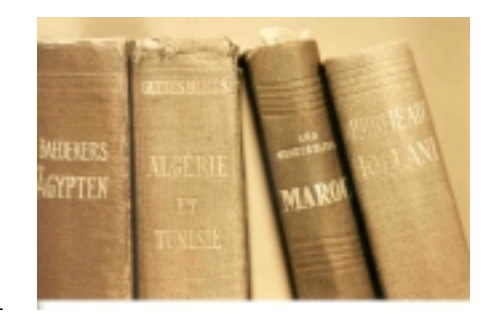
Classic guides: Some 'historical anomalies' and concerns about equitable distribution.

Digital access has enabled the library to cut print subscriptions to some indexes and abstracts. However, "it's a more difficult decision when it comes to full text," Copeland notes, "because online access requires that the user have